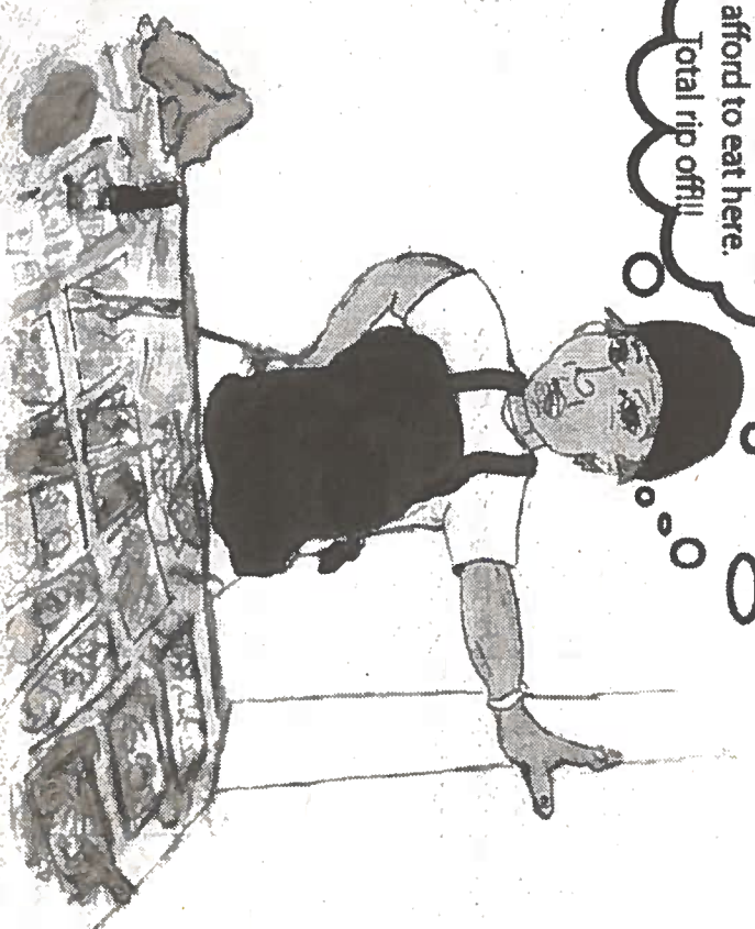
Class-Caricature by Hammer

We make this place run but we can barely afford to eat here. Total rip off!! If we got together